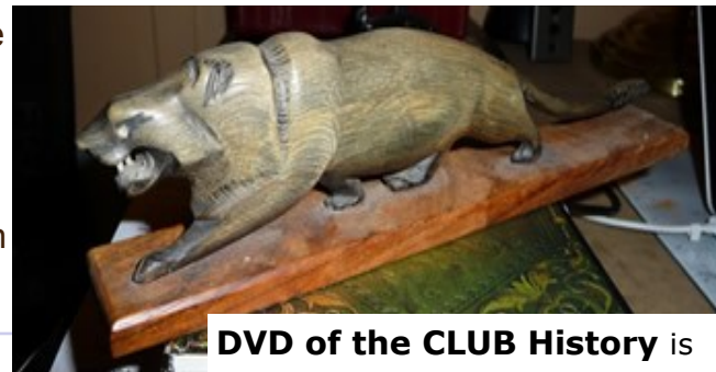
DVD of the CLUB History is available for sale at the Canteen.